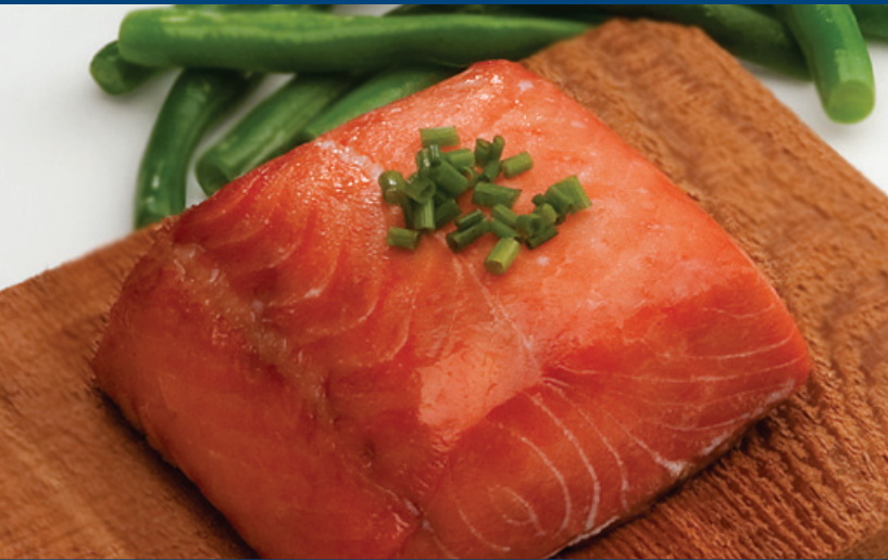
Wild Coho Salmon