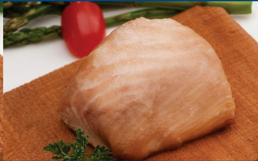
Wild Albacore Tuna