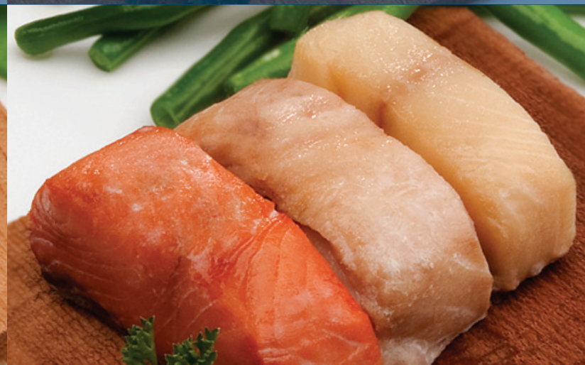
Wild Pacific Trio

Attract your customers to the seafood aisle with the convenience and gourmet taste of new Cedar Grillers.