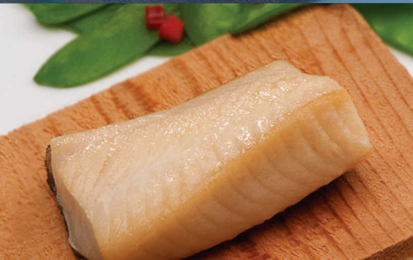
Wild Black Cod